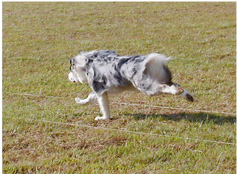
Figure 2. In this galloping dog, the dewclaw is in touch with the ground. If the dog then needs to turn to the right, the dewclaw digs into the ground to support the lower leg and prevent torque.

--from Miller's Guide to the Dissection of the Dog